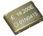
TG7050CMN TG7050SMN (4 pins)