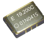
TG7050CKN TG7050SKN (10 pins)